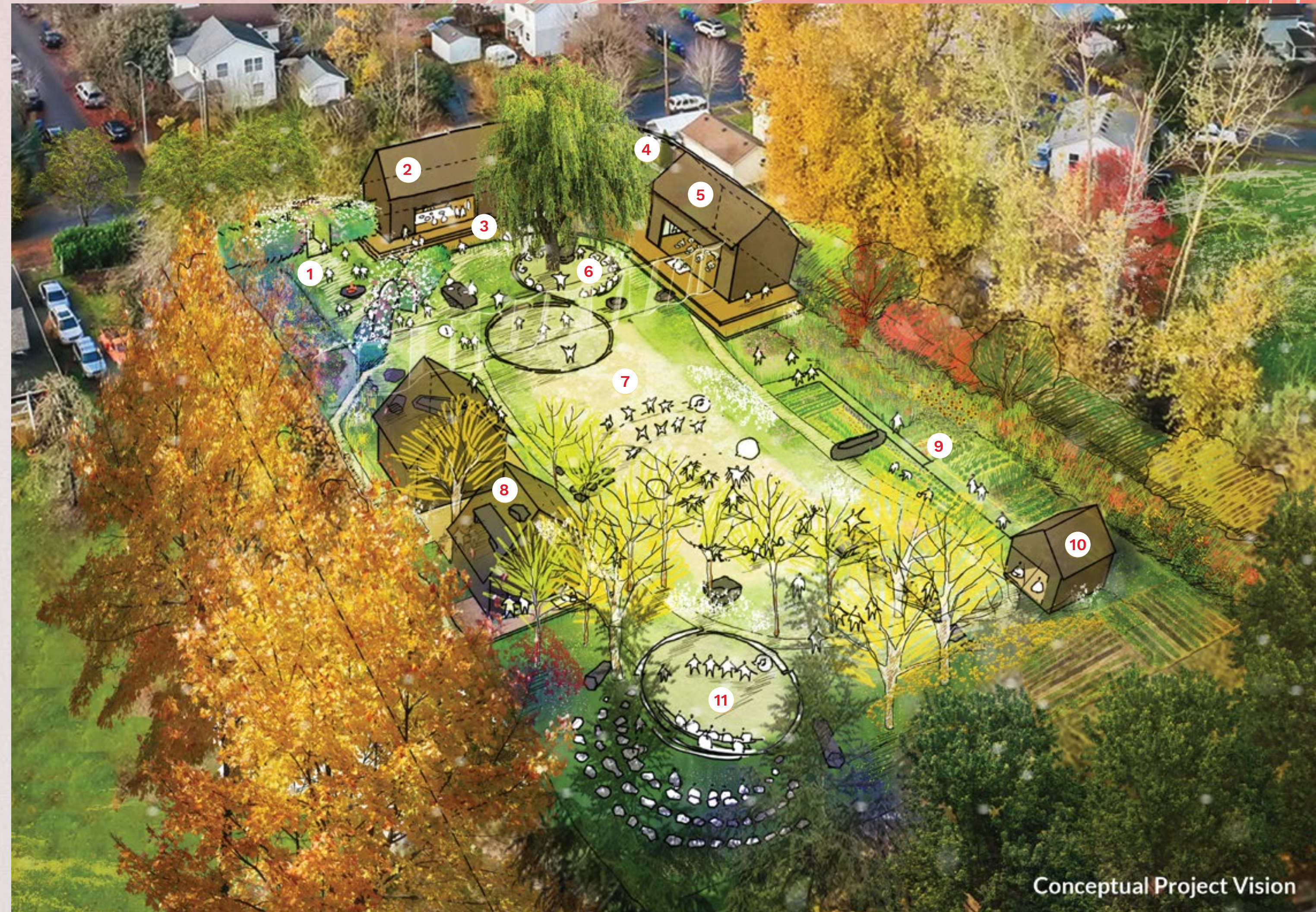
Conceptual Project Vision